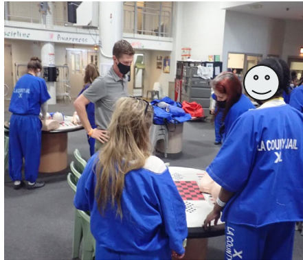
Practical skills test on manikins