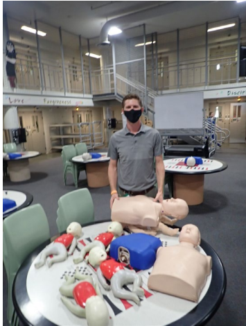
CPR/ First Aid Class at Century Regional Detention Facility