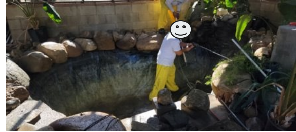
Pond maintenance and benefits of watering plants with fish waste.