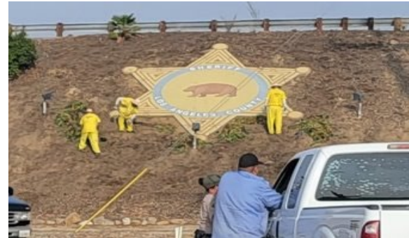
Ongoing landscape design project.