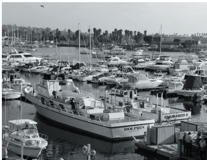
A view of the marina from the beautiful Hyatt Islandia, located on San Diego's Mission Bay

More ACCE news and information is available at ACCEOnline.org