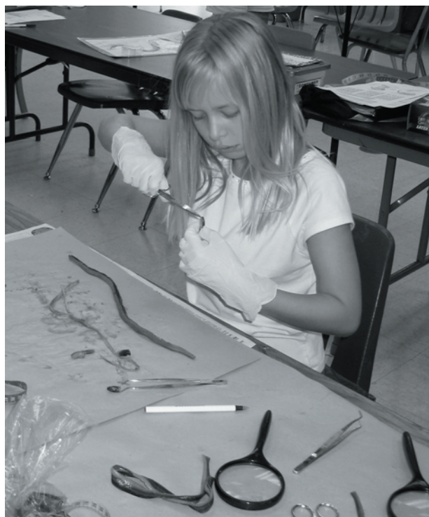
Learning is Fun at Cerritos College’s College for Youth

The ten scholarships mentioned above were also a new addition this summer, thanks to the generosity of the Cerritos College Foundation. Every summer we receive inquiries from parents and K-12 school personnel about the availability of financial aid for our program, and every summer we’ve had to say there isn’t any. I asked our college Foundation Director for assistance in identifying some potential