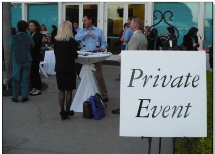
ACCE members gathered at sunset for a chance to network, catch up with old friends, and enjoy the tranquil setting.